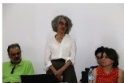
"The Multiplicity of Literary Forms"