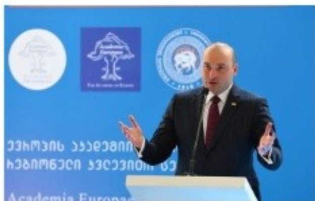
Prime Minister of Georgia, Mamuka Bakhtadze