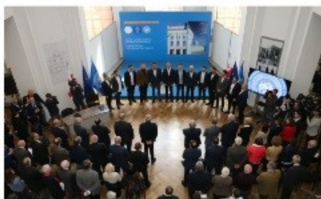
Tbilisi State University

The Tbilisi Regional Hub of Academia Europaea was inaugurated at the Aula of Tbilisi State University on the 24th of April, 2019. The President of Georgia Salome Zurbashvili has welcomed the opening of the Hub and the inauguration ceremony was attended by the Prime Minister of Georgia Mamuka Bakhtadze, Parliamentarians, the Diplomatic Corps, members of the Board of Trustees of Academia Europaea, professors and students of Tbilisi State University.