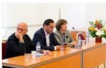
"Microbial Culture as Part of Human Culture"

The Tbilisi Knowledge Hub has launched the Distinguished Seminar Series - THE CROSSROADS, featuring presentations by outstanding thinkers and scientists. The purpose of the seminars is to popularize science, to encourage the exchange of ideas at crossroads - across the barriers of disciplines, time, and space, and to promote interdisciplinary, international scientific cooperation. Distinguished speakers are selected based on the impact of their research on the scientific community. In 2019 three seminars of the series have been organized.