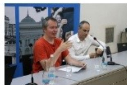
"European Dimensions of the Medieval Georgian School of Philosophy"

On 22 September, 2019 the seminar - "The Multiplicity of Literary Forms" was held by the Academia Europaea Tbilisi Knowledge Hub and the Center for Eastern Christian Studies under the DSS at Tbilisi State University.